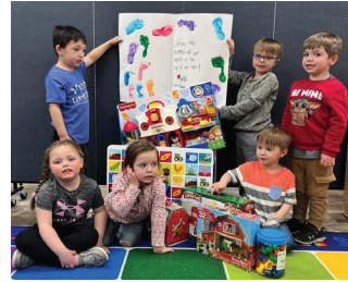
The daycare kids are so excited to start playing with their new toys!

plans. CCECA also worked with LFLC on a Revolving Loan in 2021 to assist in the purchase of the former childcare building. CCECA is proud to support LFLC. Enjoy the toys, kiddos!