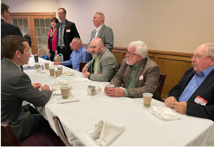
Staff and directors met with area legislators in Fort Dodge on December 20, 2022.

Over the past month, staff and directors have met with local legislators to discuss issues facing electric cooperatives and the communities we serve. Each year we monitor the legislative session and advocate the Cooperative's position on issues that could affect our member-owners.